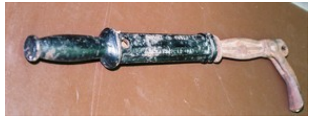
Crescent Nail puller