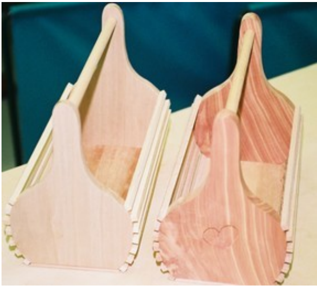
Baskets for toy program