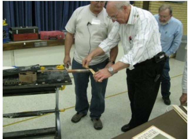
Heat wood bending