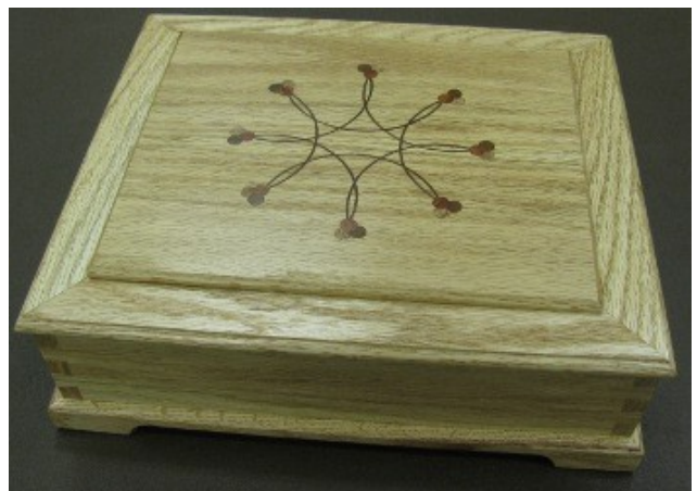
Roy Haden- several boxes from Winge wood-- pretty but brittle wood; used oil finish