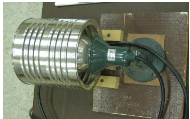
Terry's bend tool

Galen Cassidy showed sanding blocks and what he picked up at garage sale