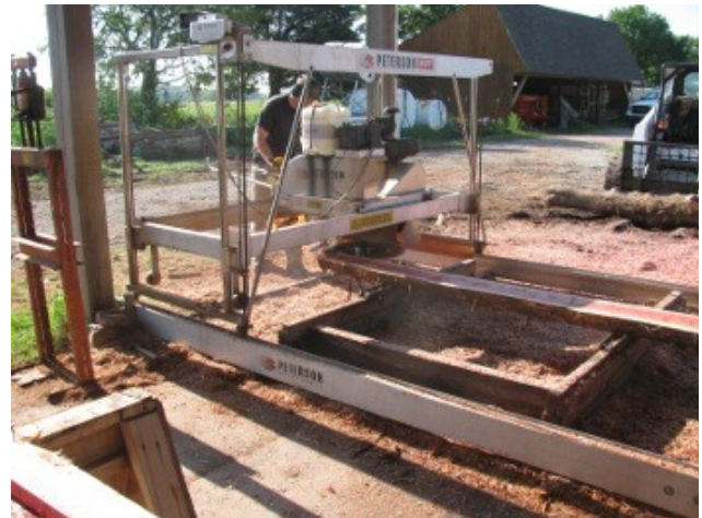
Milling a board with the circular saw mill.