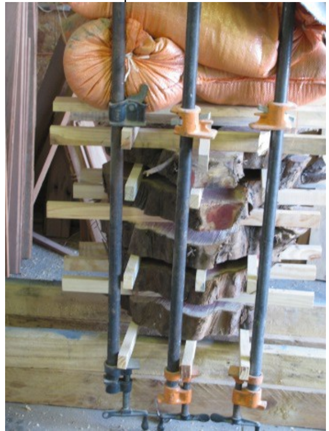
Slabs from a yew stump for a custom project