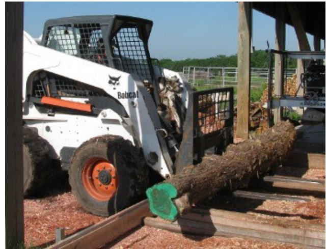
Loading a red cedar log onto the saw base.

After Assembling at 9:00 AM at the sawmill: