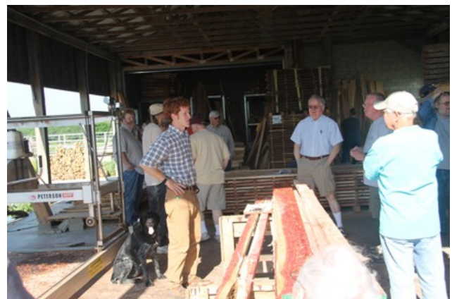
Stack of cedar from the sawn log