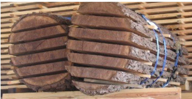
Drying complete logs for matched drawers or other projects