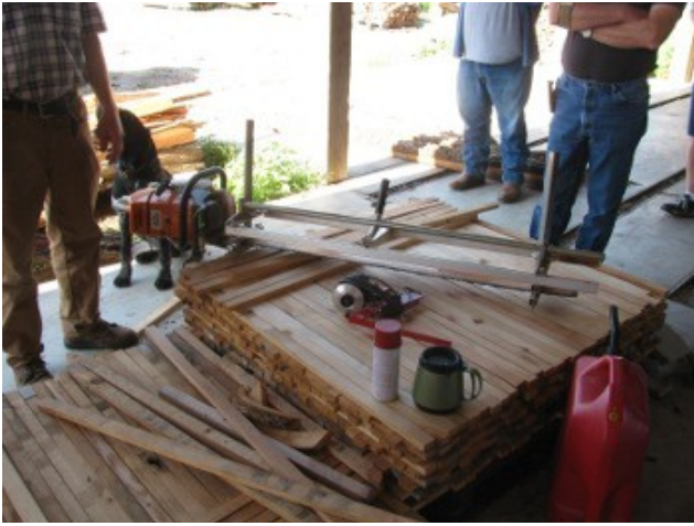
Chain saw used to cut slabs from larger diameter logs