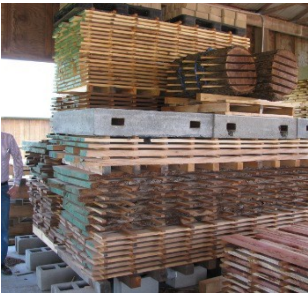
Lumber stacked and weighted for drying