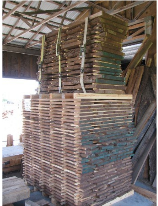
drying stack with slabs on top. Slabs are 2+ inches thick and up to 3 feet wide.