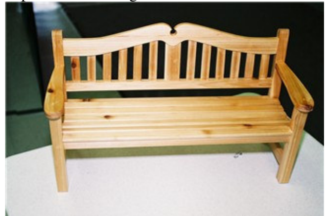
Inspired by 2x4 challenge (Kenny Hill)