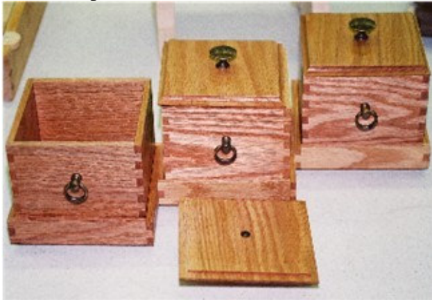
Box project first box joints ( Hay Hazelwood)