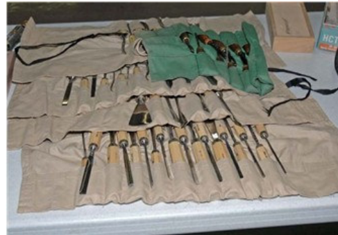
More carving chisels