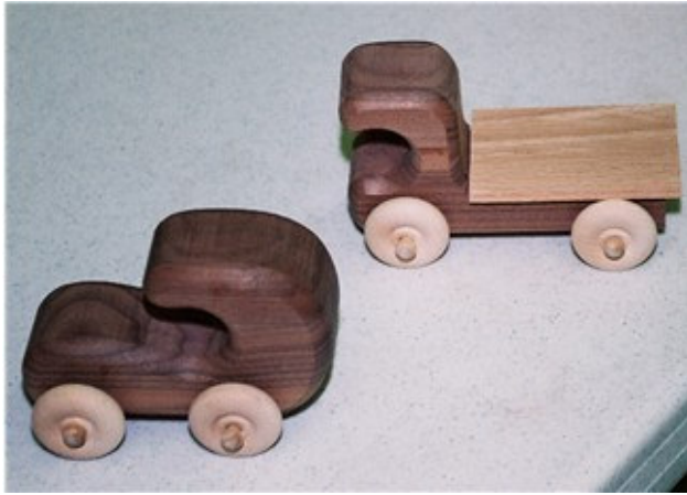
More Simple vehicles