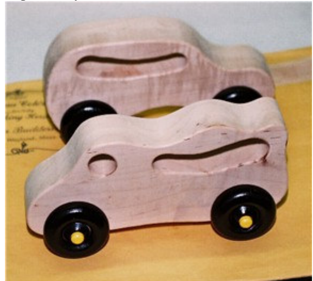
Simple cars for Toy Project