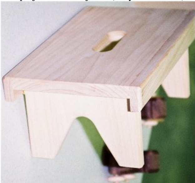
Stool ( Clark Schultz)