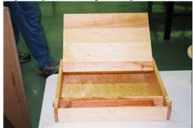
Lap desk by Bill Tumbleson