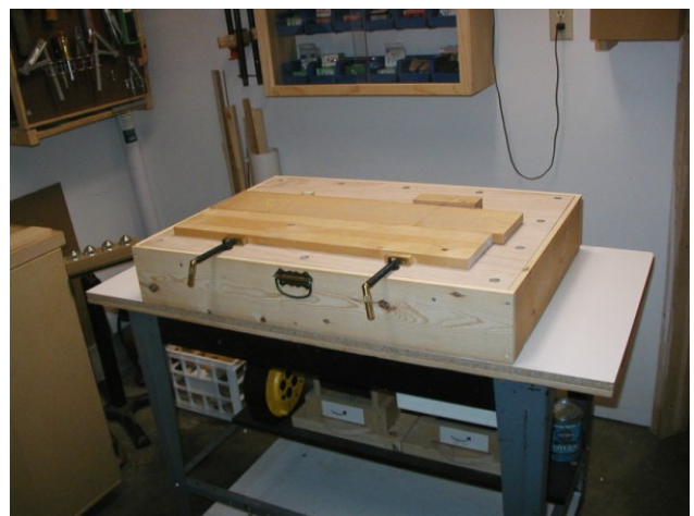
Bill Tumbleson's clamp table/downdraft box