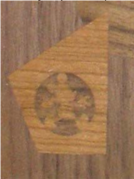
Close up of veneer insert (Mickey)