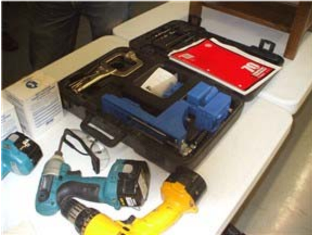
Kreig tool kit