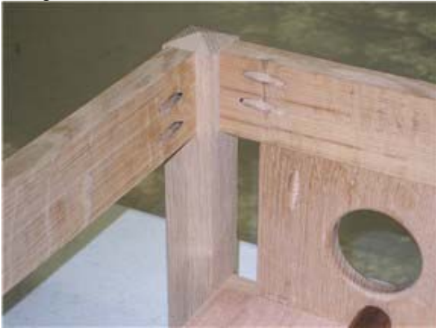
View of pocket holes in construction