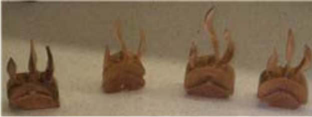
Ray Albert's sea grass carving