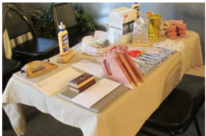
Door prizes donated by various members