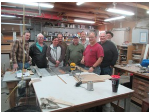
January Burt's Barn group

If you have questions about Burt’s Barn or other woodworking questions feel free to call me at 316-655-4151.