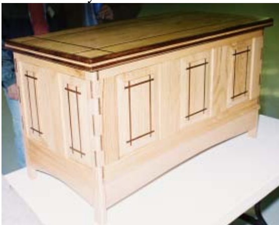
With it's hidden drawer

Galen Cassidy's Blanket chest with walnut inlays.