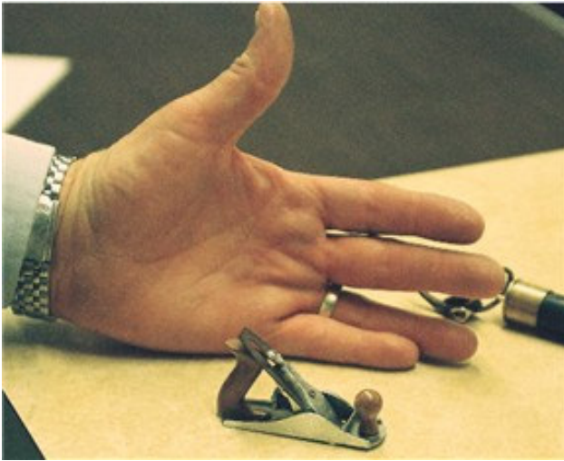
A real plane