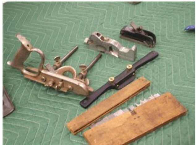
Still more planes