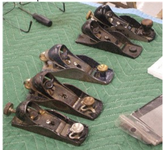
Even more planes