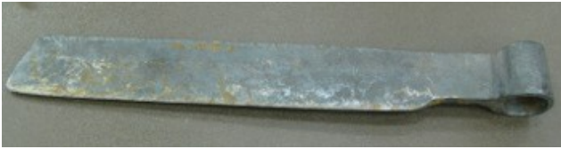
Foe for splitting wood