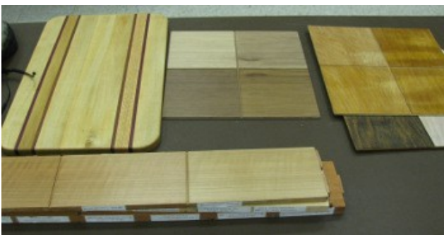
Story board for stains and finishes in combination