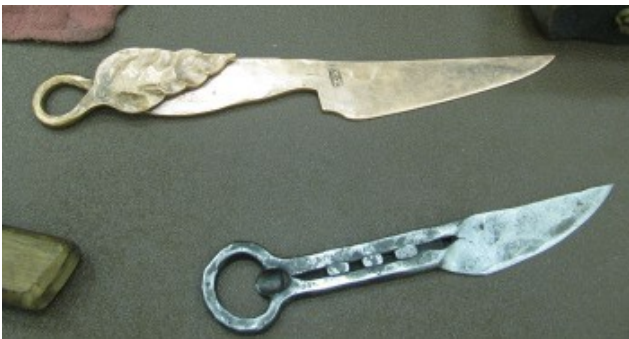
Knives pierced and hammer shaped