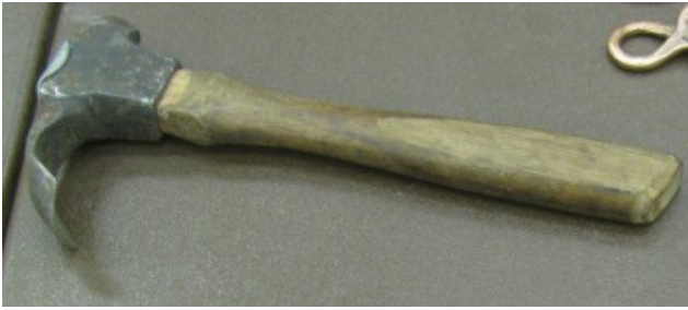
Adze forged from a claw hammer