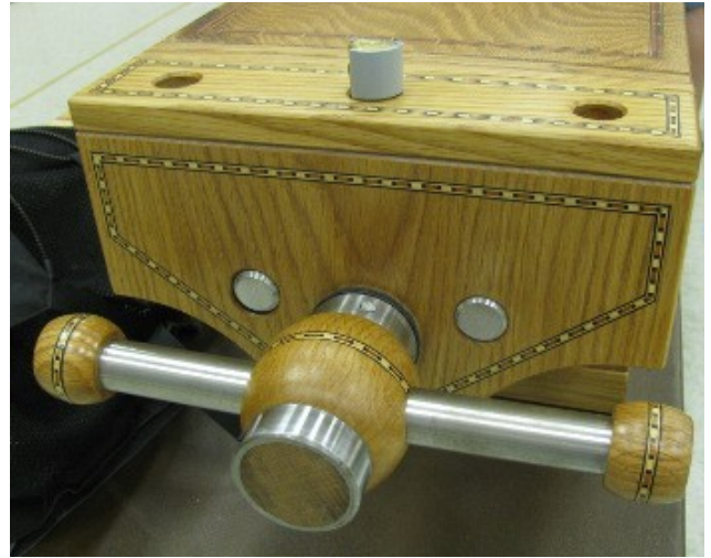
Les Hastings tricked out vice/carving bench.