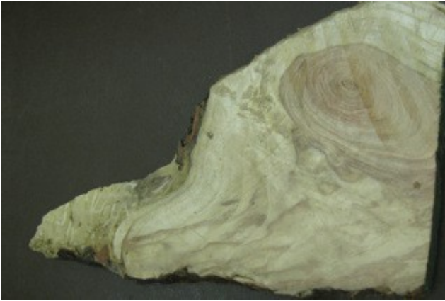
Cutoff of log sawn at Eldersile Sawmill